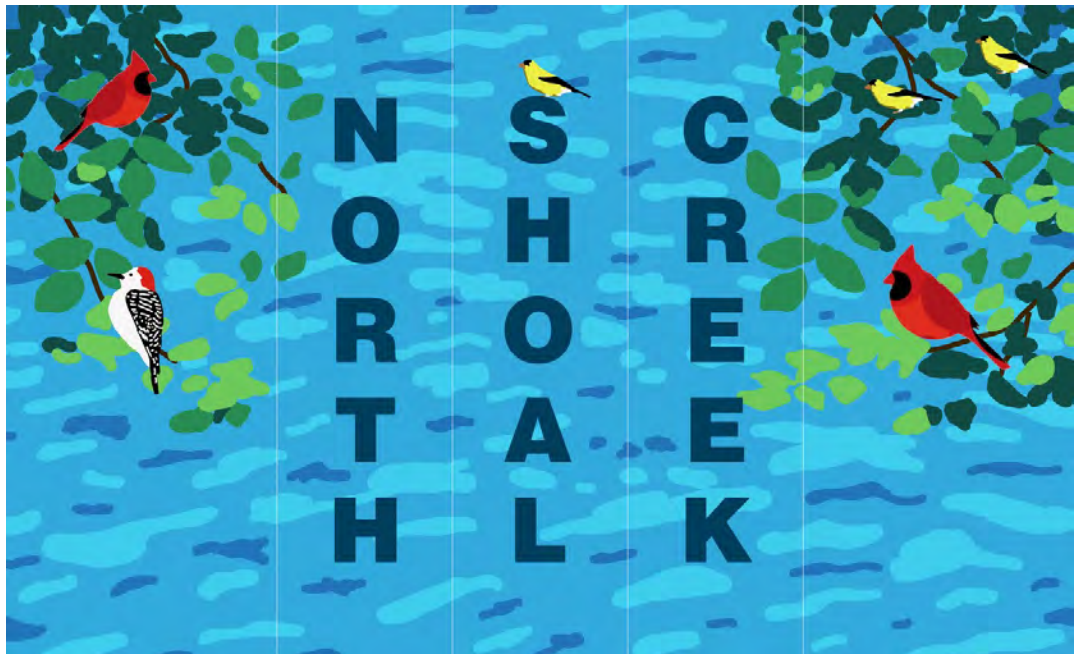
Designs for a bridge: Above, the mosaic design for the bridge's south railing; below, the north side. Though shown here together, the five panels that make up each design will be spaced out along the length of the railing.