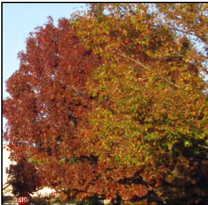
Red oak foliage in North Shoal Creek, Fall 2018.

Call us at 512-362-6318 to schedule a tour.