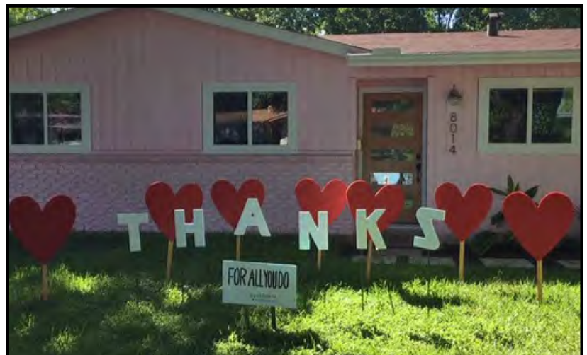
Right: A heartfelt thank-you to essential workers