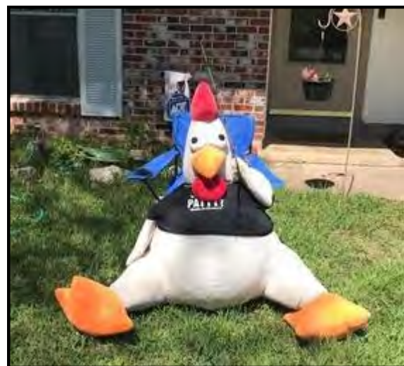
Above: A new neighbor — his name is Cluck Kent — takes up residence in a front yard on Briarwood.