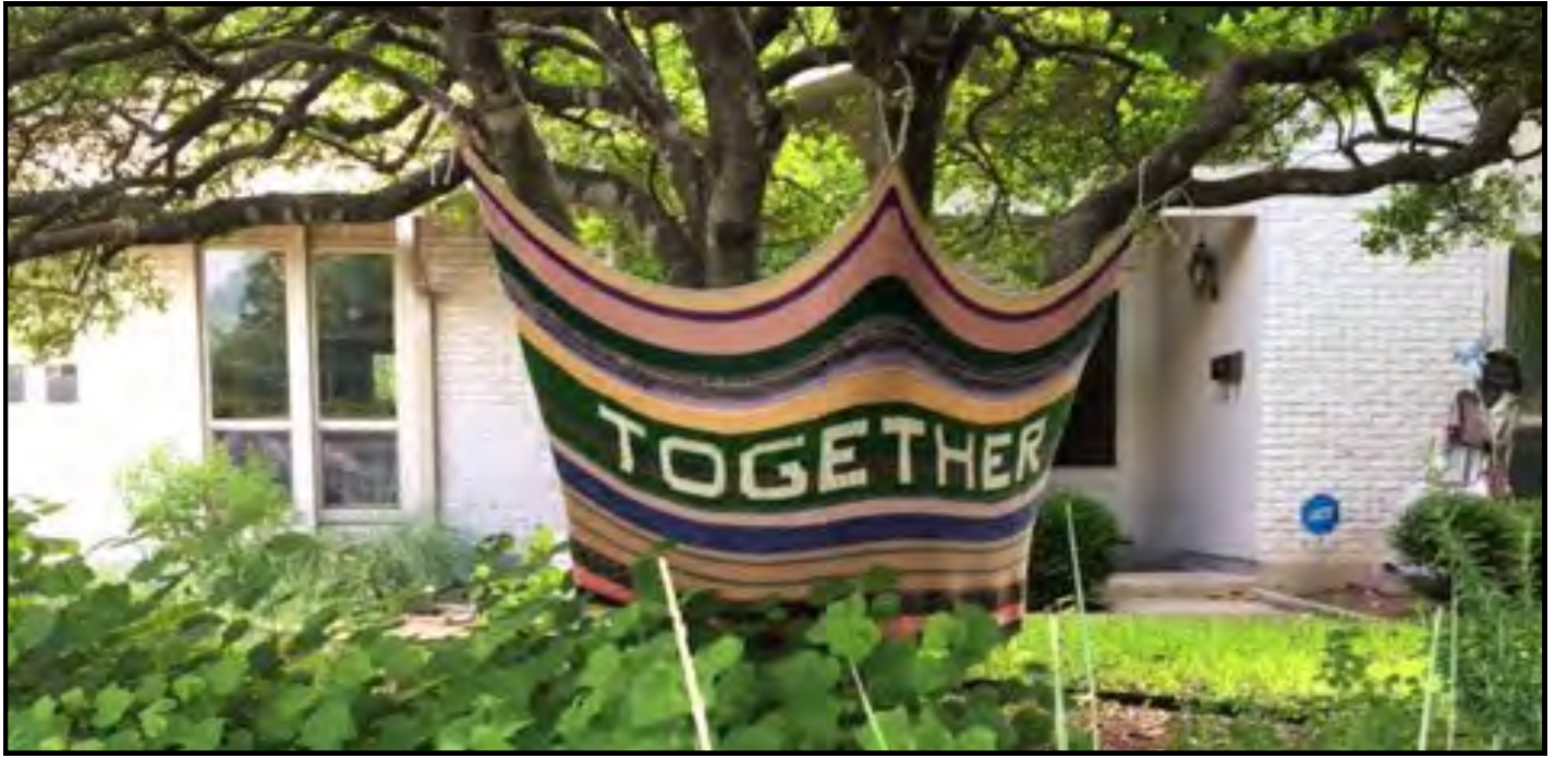
Weaving, Benbrook Drive, May 2020.